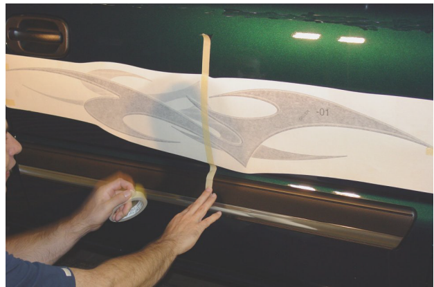
2. Apply a strip of tape vertically through the center of each component and lightly tape each end of the graphic panel to the vehicle.