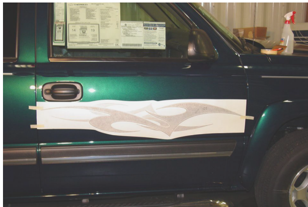
1. Tape the graphic onto the side of vehicle to determine exactly where you want the graphic installed.