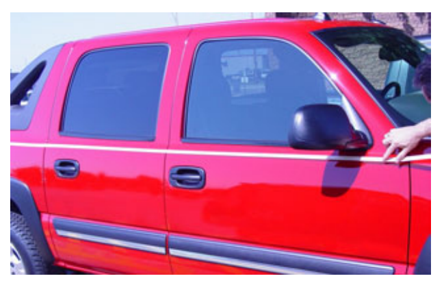
2. Hold the tape firmly as you tack it down at the end of the quarter panel. Repeat Step 1 for the door areas.