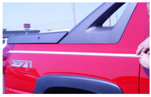
5. Lay the stripe along the bottom edge of the masking tape. Once in position, press firmly with your thumb or a squeegee along the entire stripe. Now peel back the clear premask at a 180 angle from the application surface.