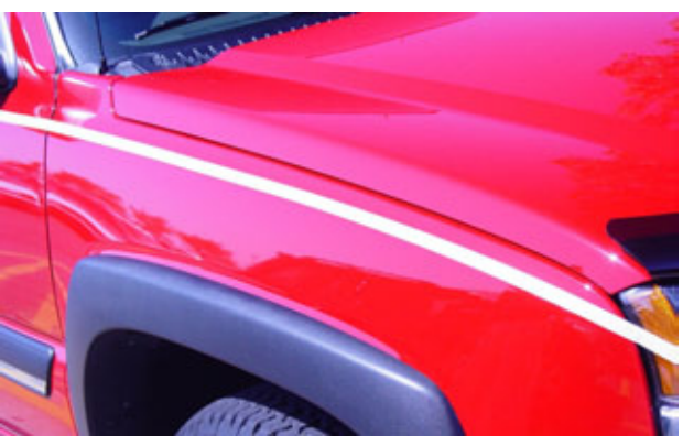
4. If necessary, lift the masking tape and reposition as needed if you don't lay it into a satisfactory position on the first attempt. Step back to view the overall placement of the tape. Adjust as needed.